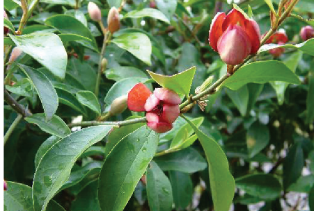
Port Wine Magnolia