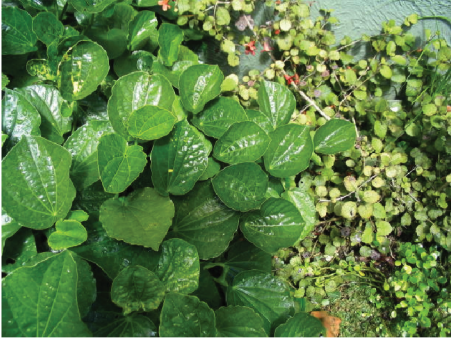
Three Kings Kawakawa