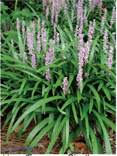
Liriope 'Evergreen Giant'